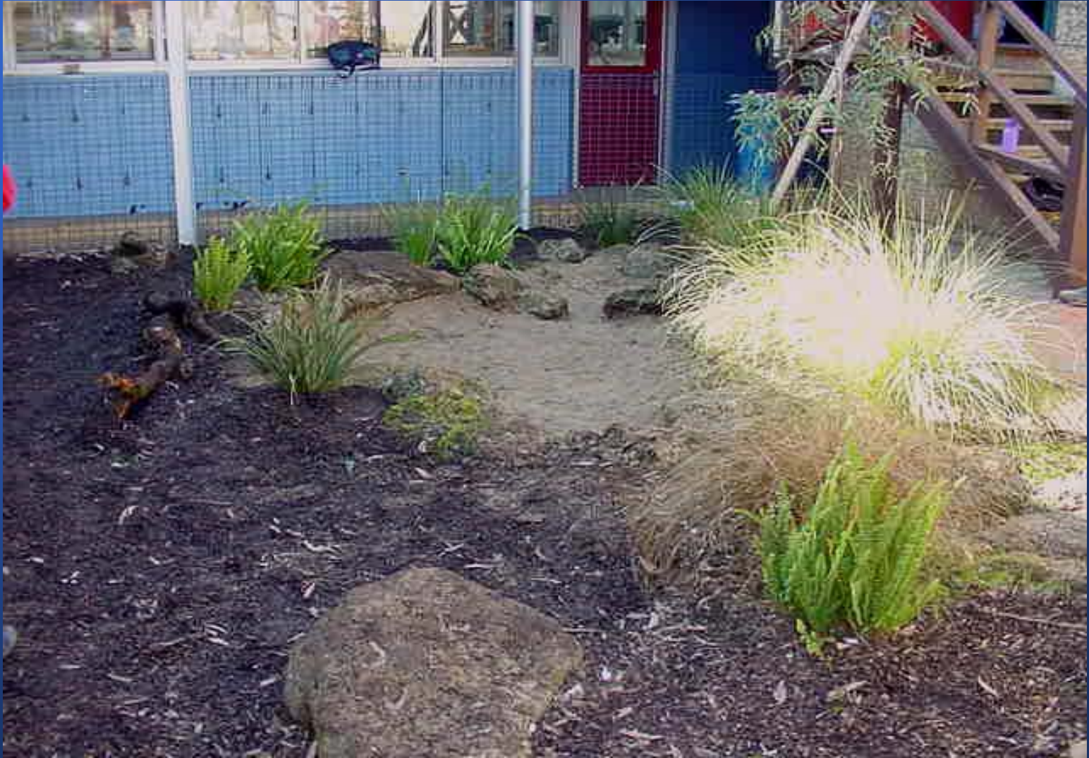
Native Frog Bog