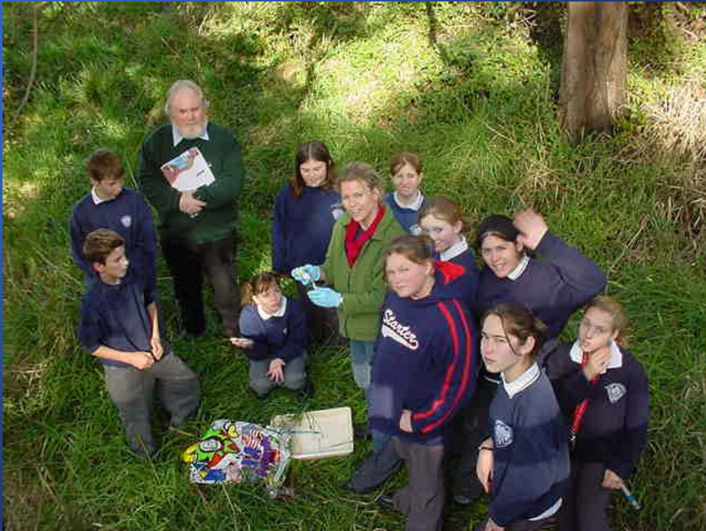
Water Watch Sampling