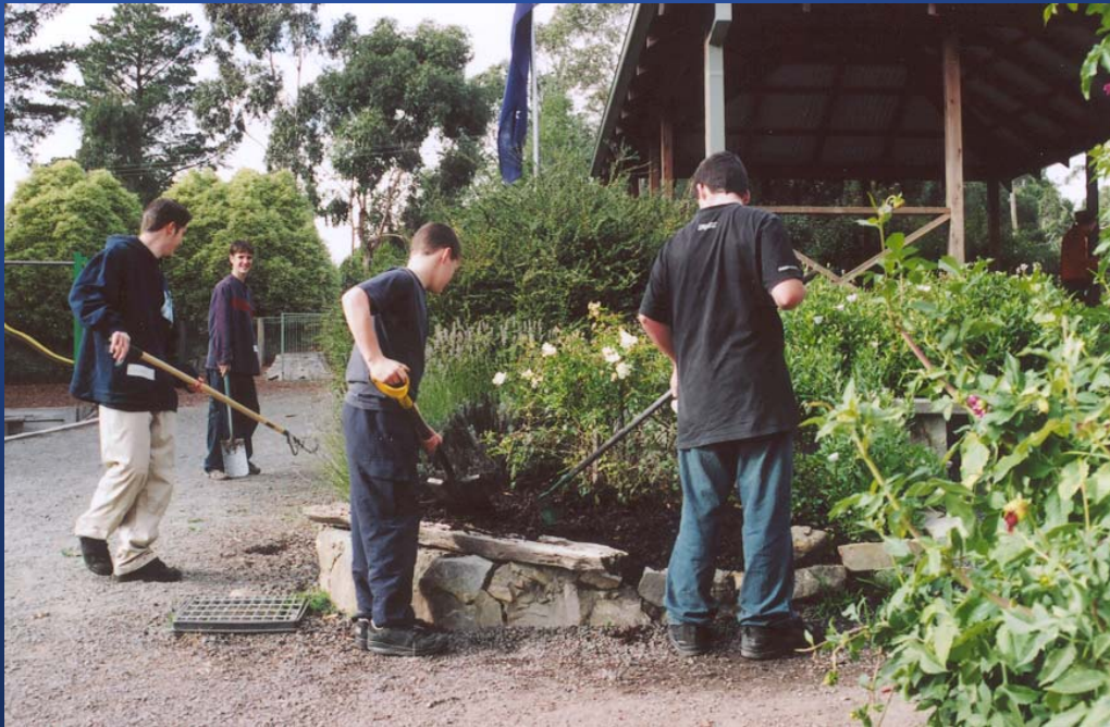
Hoddles Creek Primary School